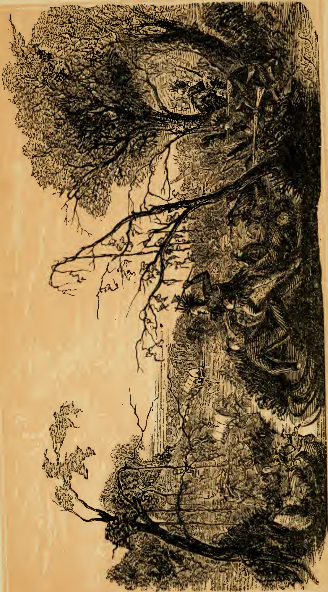
MASSACRE OF THE WHITES NEAR DEERFIELD.